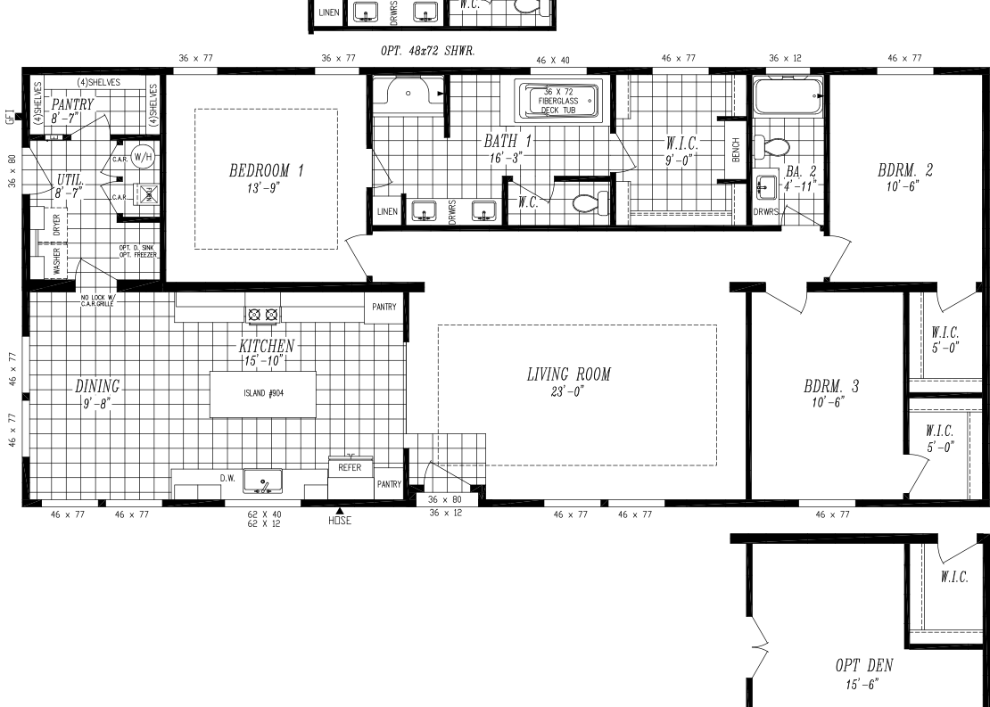
OPT DEN I.P.O. BEDROOM